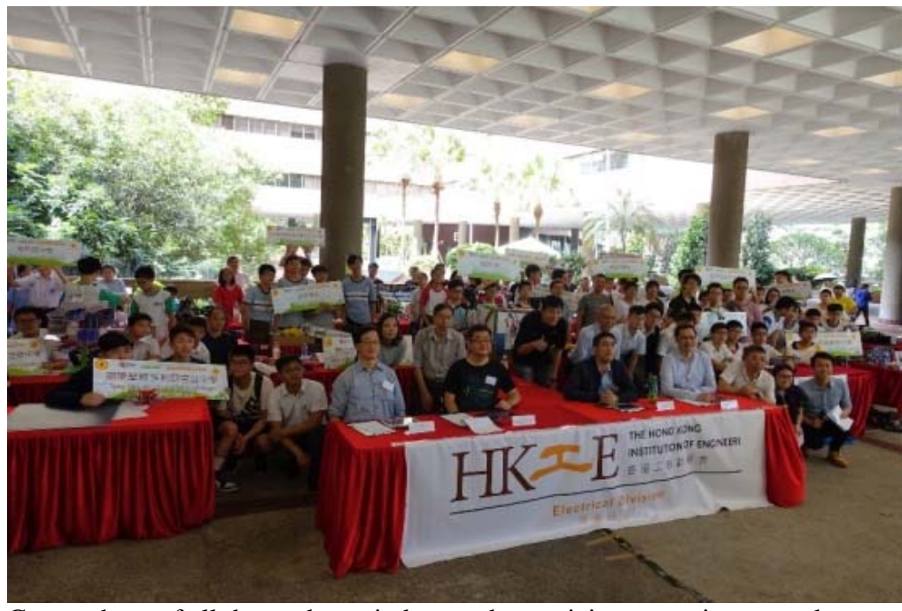
Group photo of all the students, judges and organizing committee members